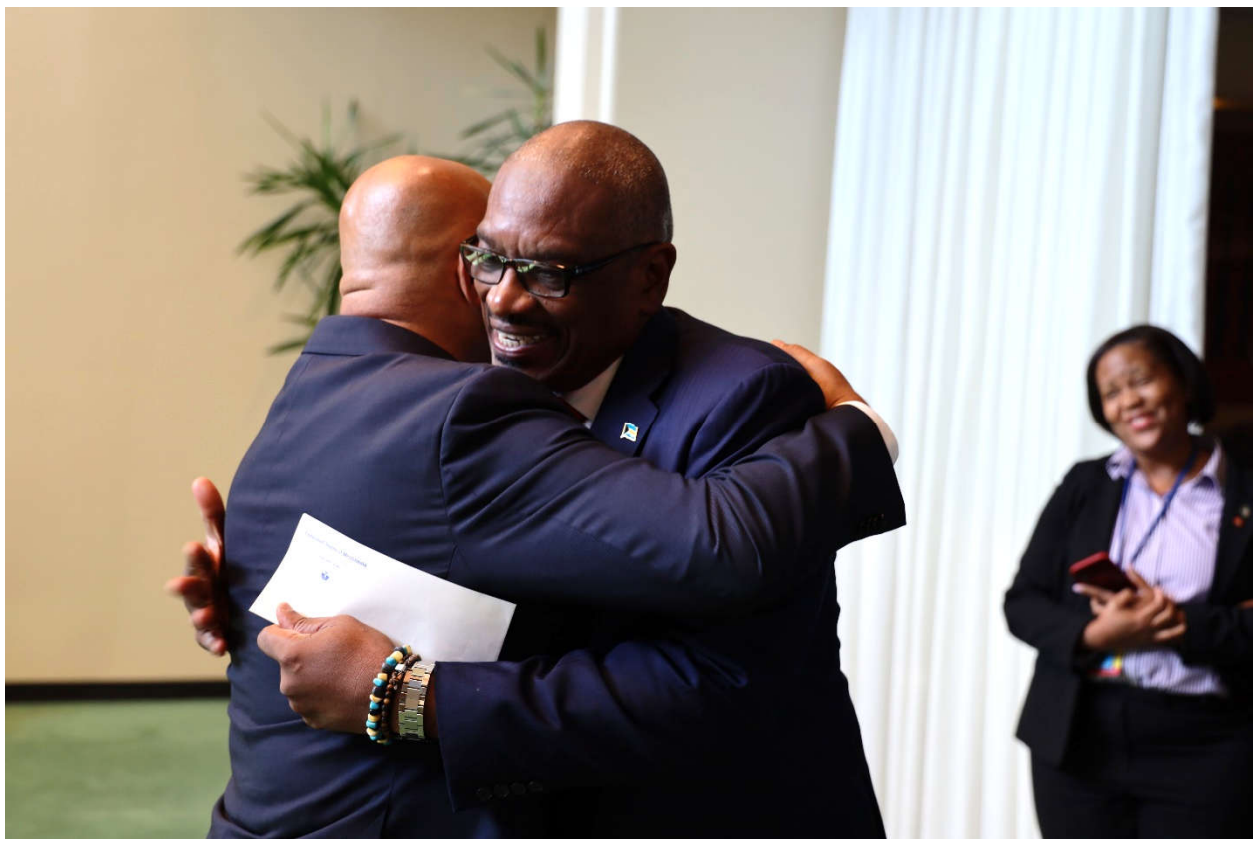
Pictured Above: Prime Minister Minnis and President Panuelo hug after the exchange of the $100,000 of relief; the Federated States of Micronesia stands in solidarity with its brothers and sisters from Small Island Developing States